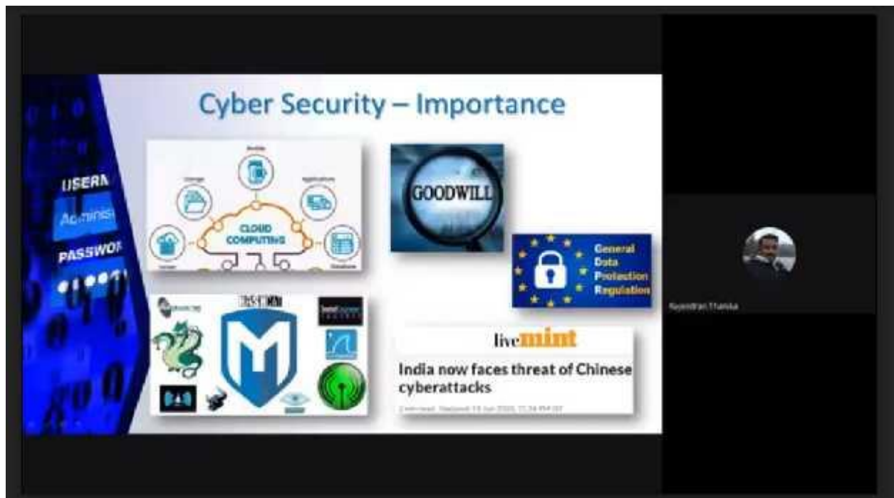
Screen Shot of Cyber Security Importance